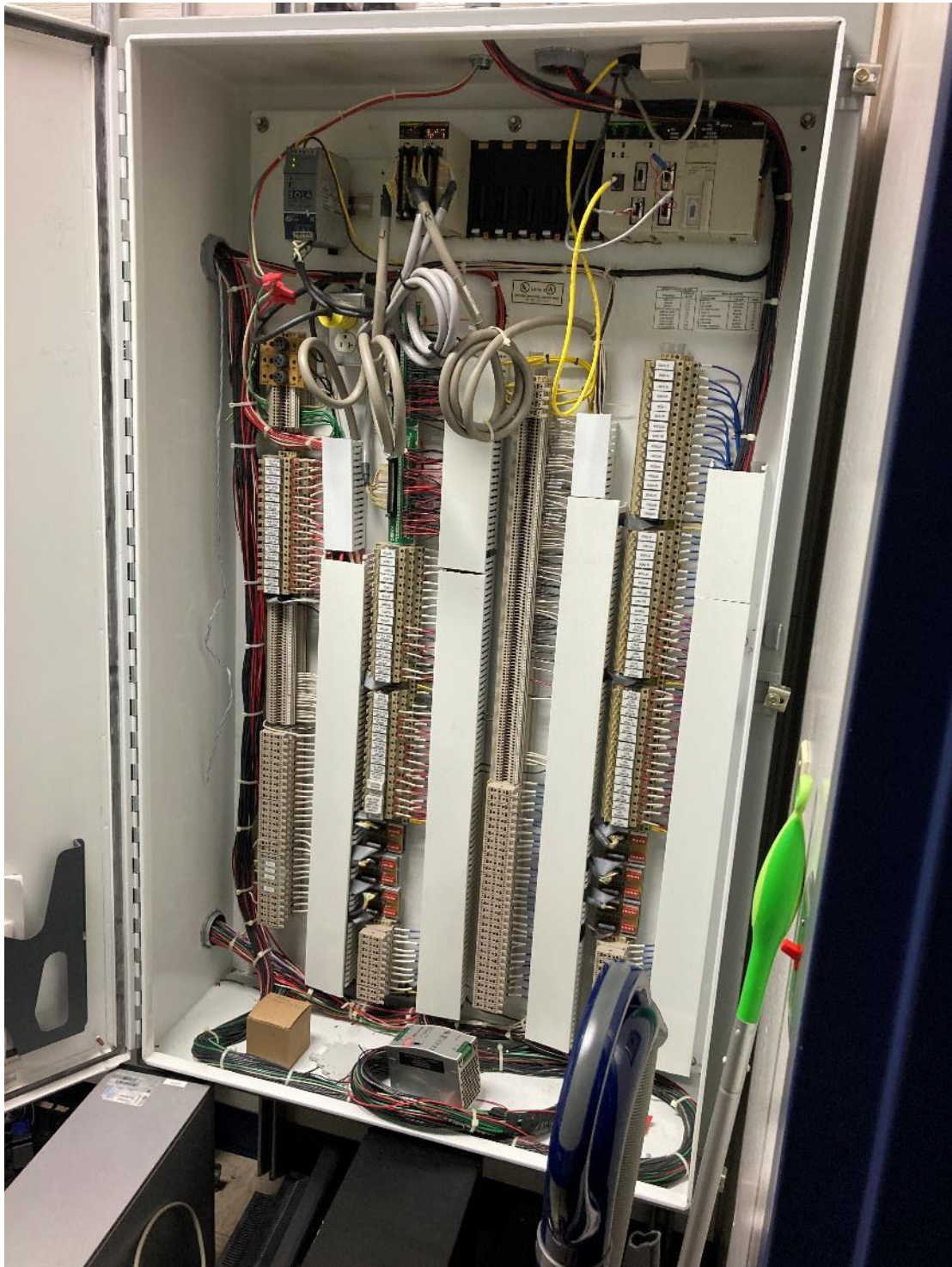
Jail PLC System Panel in existing Radio Room